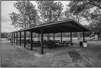
Patriots County Park Jackson 80 persons