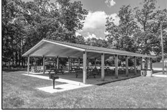
A. Paul King County Park Manahawkin 110 persons