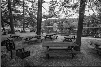
Ocean County Park Lakewood 500 persons