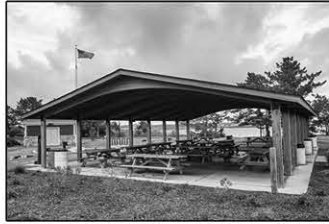
John C. Bartlett Jr. County Park at Berkeley Island 110 persons