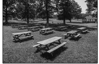
Stanley Tip Seaman County Park Tuckerton 95 persons