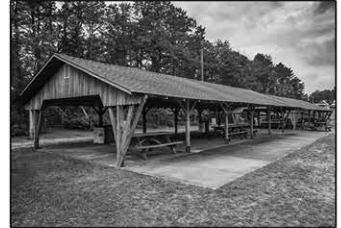
Robert J. Miller Air Park Berkeley Township 100 persons